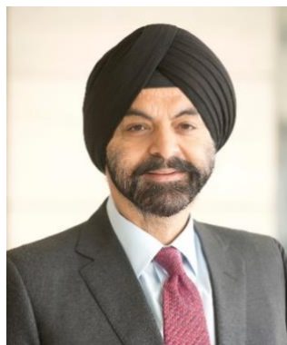
Mr. Ajay Banga Vice Chairman General Atlantic

Ajay Banga is Vice Chairman at General Atlantic. He joined General Atlantic after 12 years at the helm of Mastercard, leading the company through a strategic, technological and cultural transformation over 11 years as president and chief executive officer and one year as executive chair of the board of directors. Over the course of his career, he's become a global leader in technology, data, financial services and innovating for inclusion.